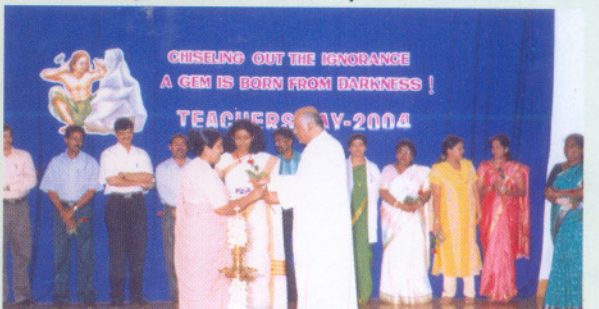
Teacher's Day Celebration