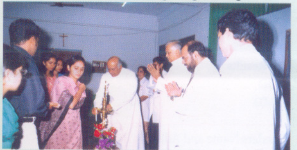
Inauguration of Internship 2004-05 Batch