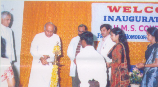
Inauguration of New batch of students - 2004-05 Batch