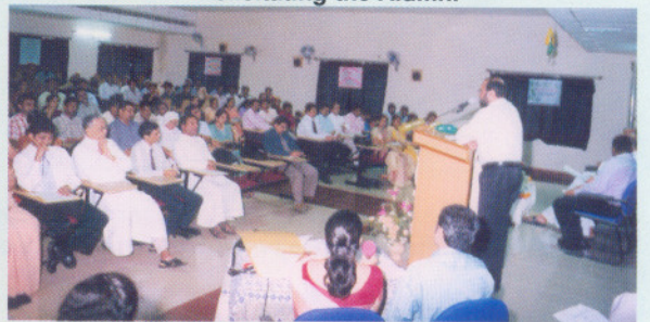
Principal addressing the gathering